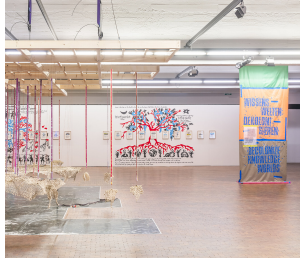
Akademie der Künste Exhibition „The Great Repair“